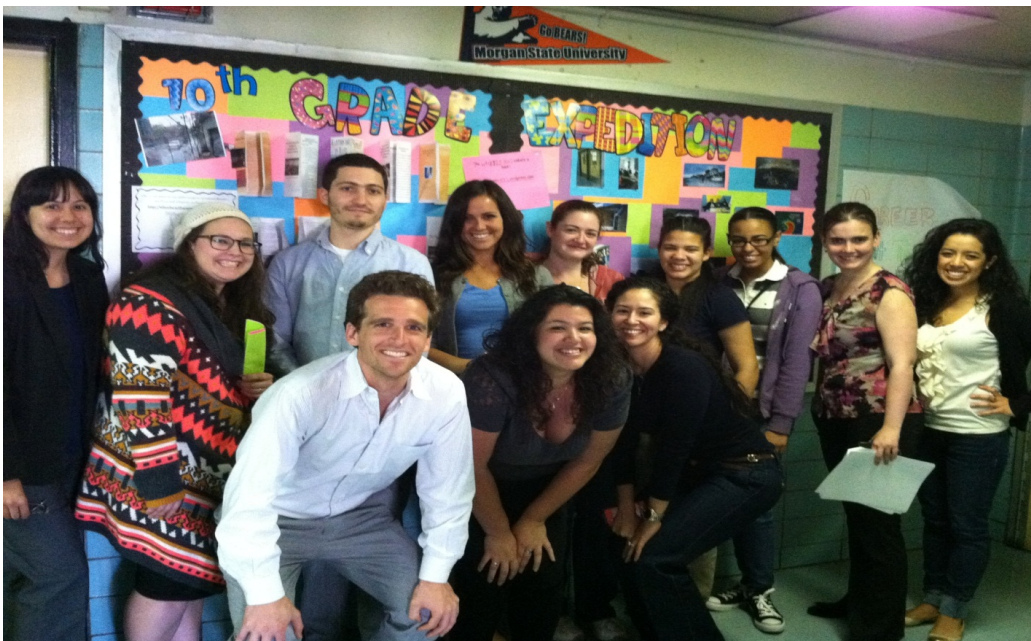
The Safe Passage Team at Citizenship Day at a NYC Public School in Washington Heights.

According to the High School Spanish teacher, “Safe Passage is a lifeline for many of our students. As an educational community that aims to secure the opportunity to attend and succeed at a college of each student’s choice, we need the help, guidance and collaborative effort of the Safe Passage Project lawyers. As we work together as a team, we can finally serve the needs of ALL of our students, documented and undocumented alike. –NYC PUBLIC SCHOOL TEACHER