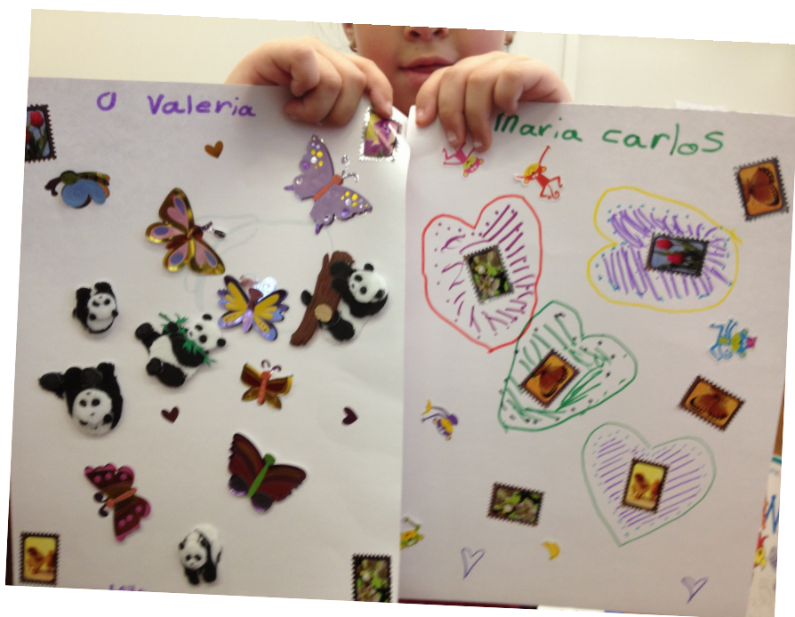
Children's art work made in the court screening room.