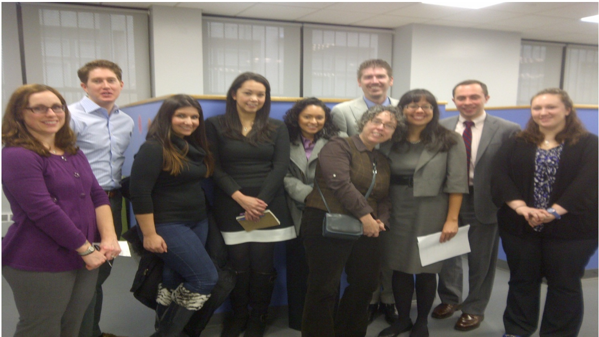
The Safe Passage Team at SCO Family Services in Queens, New York.

Safe Passage faculty and students participated in several Deferred Action for Childhood Arrivals clinics. This year Safe Passage forged a partnership with African Legal Services Committee and together we were able to ensure a number of youth obtained DACA and access to two year renewable employment authorization. Through regular meetings and jointly sponsored continuing legal education events, Safe Passage has worked to improve the representation of immigrant youth in both immigration and family courts as well.